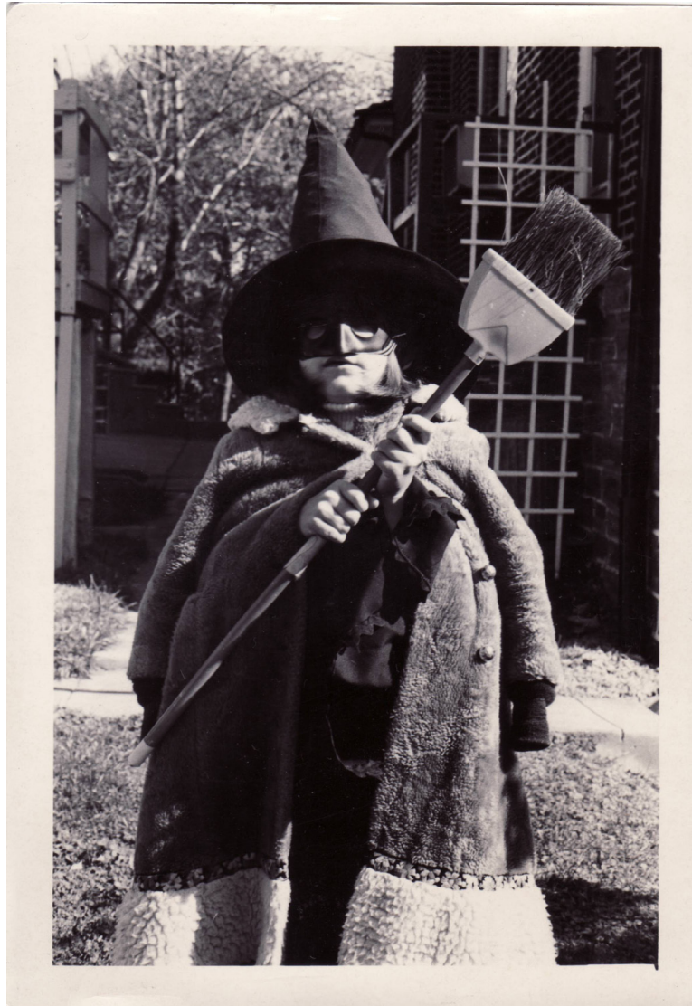
Me on Halloween