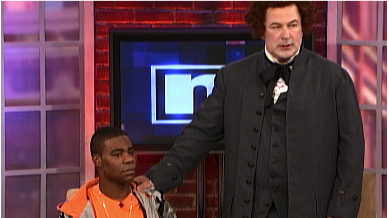
Episode 118-30 Rock-NBC

Tracy finds out he is a descendant of Thomas Jefferson.