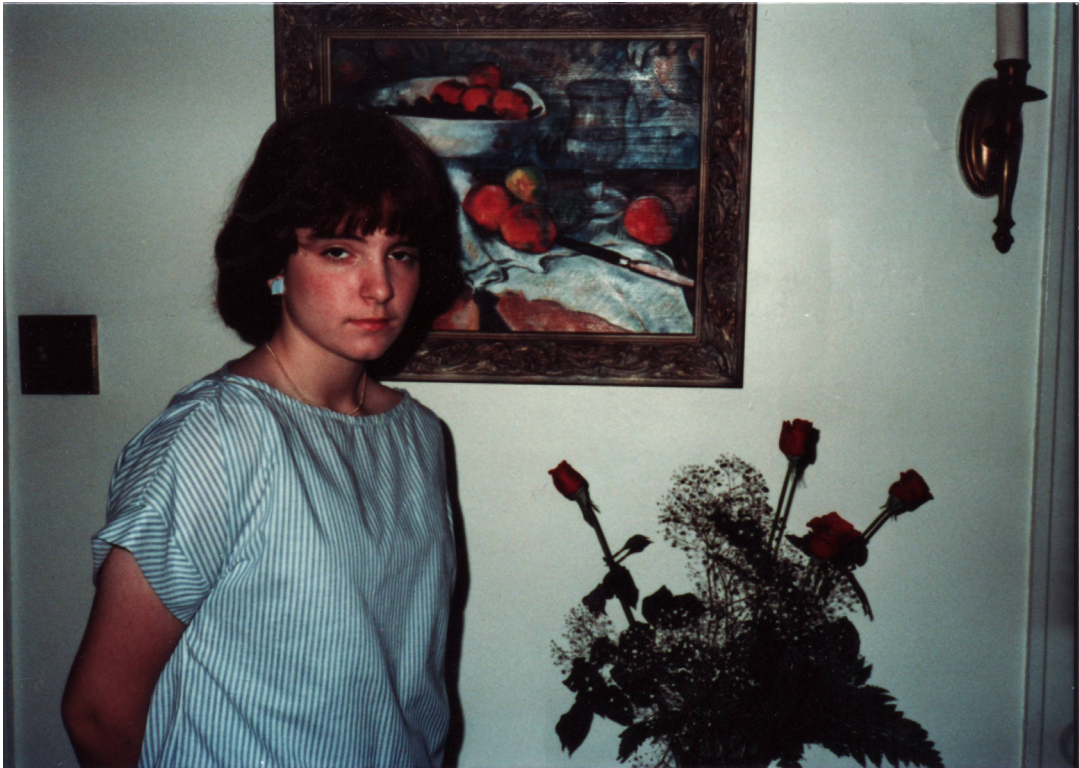
Me with Flowers