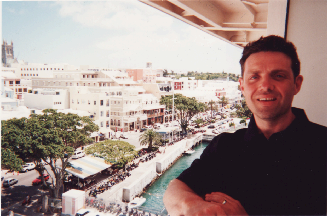
A picture of my Husband on our Honeymoon