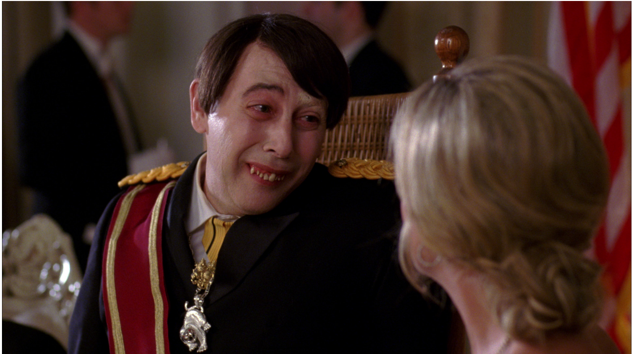
Episode 111-30 Rock-NBC

Gerhardt Hapsburg was played by Paul Reubens.