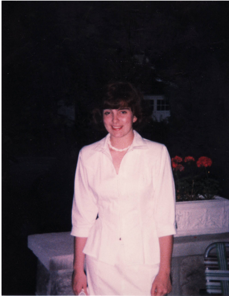
Kickass White Denim Suit